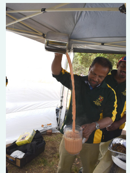
சம்பத்திரிசியார் தேத்தண்ணிக் கடை